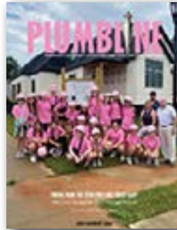
On the cover: The participants in the 2024 PWB Girls Build Summer Camp tour the 2024 Parade of Homes Showcase Home built by Pickering Building and Renovations. Pictures on page 4