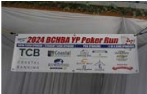
Thank you to all of our sponsors