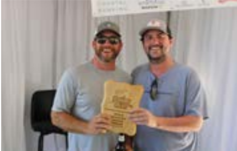
The Best Dock People's Choice Award - Pitman & Brown